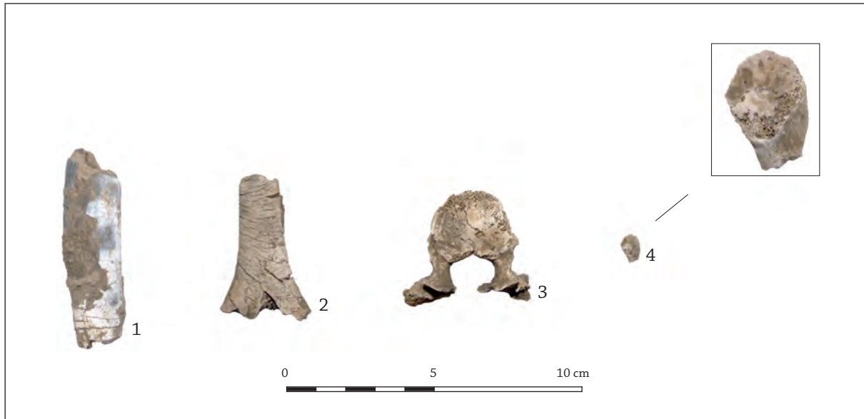
Fig. 1. 1. Fragment from the femur diaphysis (left/right), from the individual inventory no. 1168, showing bluish-grey areas specific to lower temperatures (300–400° C); 2. Cremated bones with transversal cracking and splitting, indicating that they were covered with flesh when incinerated (Inventory no. 1169); 3. The upper face of a thorax vertebra that displays disk prolapse (Inventory no. 1169); 4. Element for the determination of age – medial diaphysis of the clavicle with welding traces (Inventory no. 1169).

of the skull cap (Fig. 1/2) suggest the presence of soft tissue on the surface of the bones at the time of incineration.