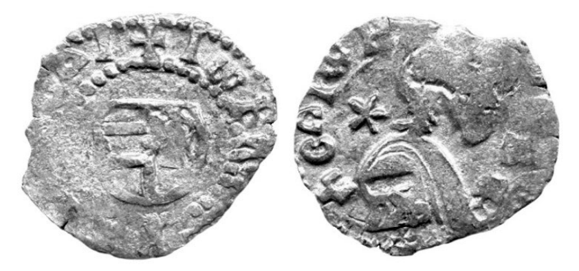
Fig. 5. Ducat minted by Vladislav II, type C (taken from: Costin 2006–2007, fig. 1)