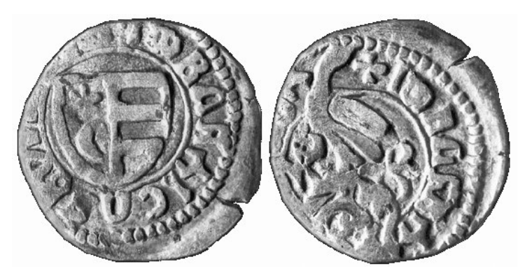
Fig. 1. Ducat minted by Vladislav II, type A