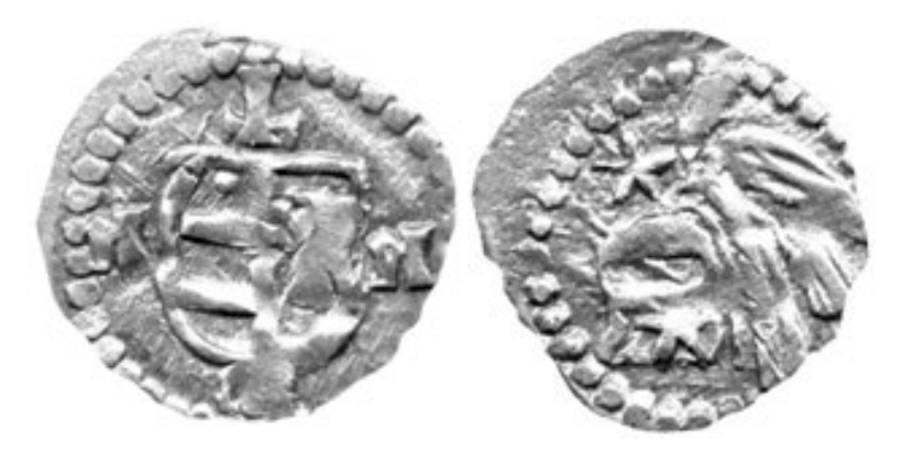
Fig. 6. Ban from the time of Vladislav II