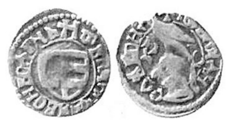
Fig. 4. Ducat minted by Vladislav II, missing the crescent moon from the first quarter of the shield on the obverse (taken from: Petrov, Dergačeva 2012, 131, fig. 1/6)