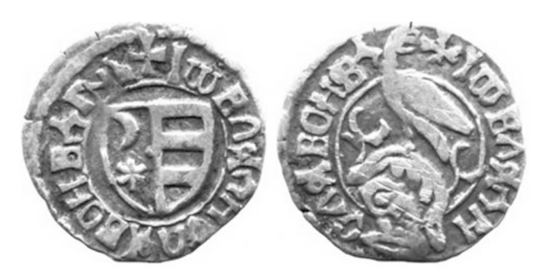
Fig. 2. Ducat minted by Vladislav II, type Ba (taken from: Петров, Дергачева 2012, 194, fig.3/22)