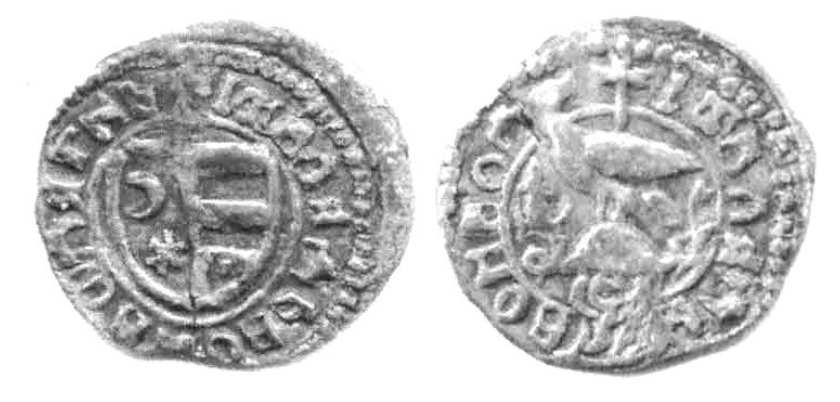
Fig. 8. Ducat issued by Vlad III Ţepeş